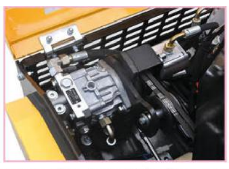
American light-duty variable plunger pump drives the machine stepless speed walking