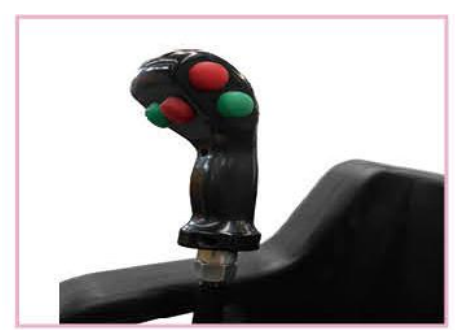
Electromagnetic clutch integrated controllever easy to operate