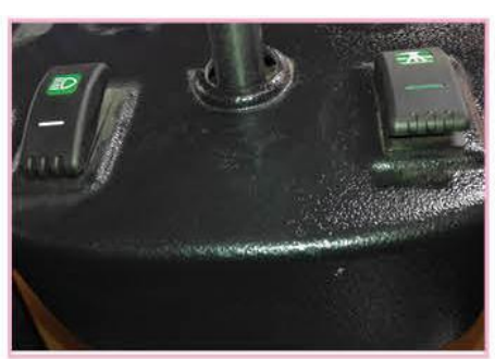
Water-spraying electrically controlled user-friendly