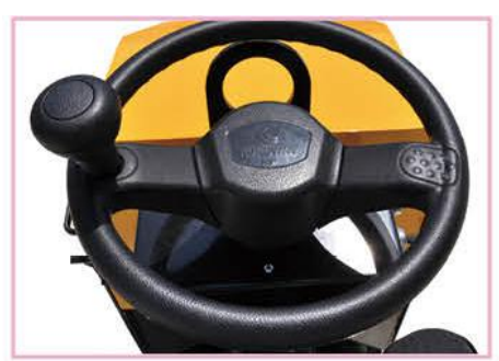
High-grade foaming steering wheel operate comfortable