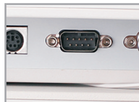
Easy Manage with PC