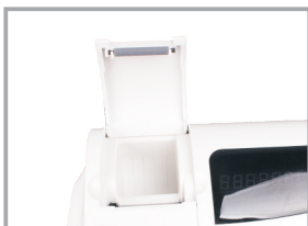
Easy Paper Loading