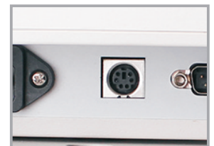
Support Barcode Scanner