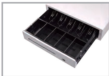
Adjustable bill and coin slot