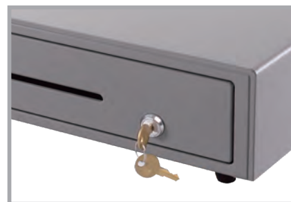
3 level solid lock