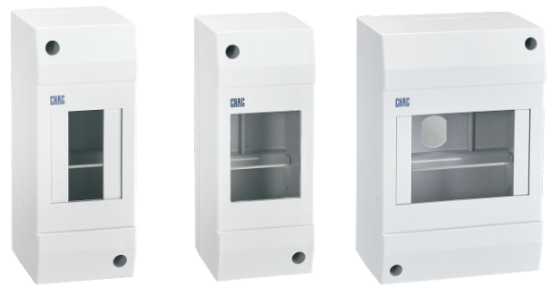
CQMG05-2 Door cover