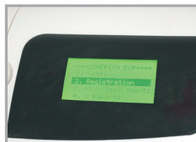
5 Lines LCD Display