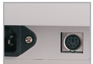
Support Barcode Scanner