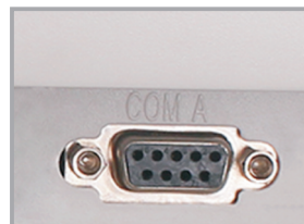
Easy Manage with PC