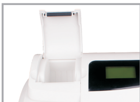
Easy Paper Loading